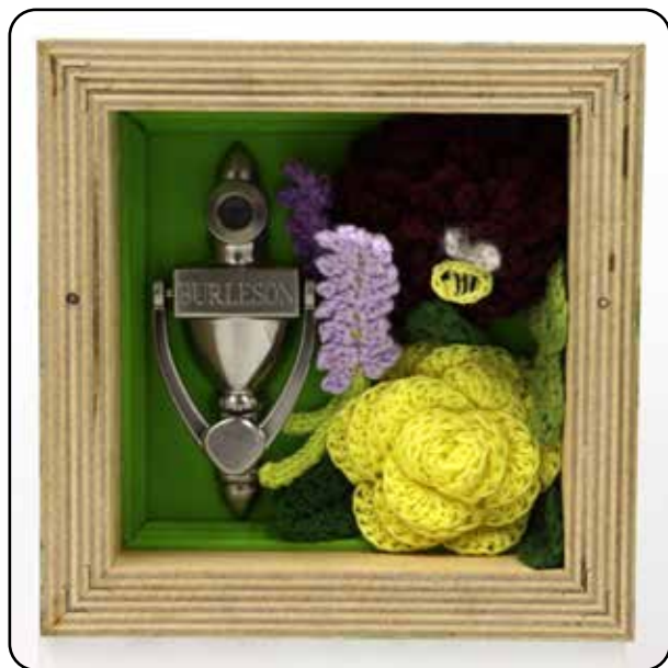
The neighborhood is represented along the border of the painting through a ribbon of whimsical watercolor and acrylic house portraits. The homes represented are those on either side, and across the street from, the family's home. Great attention was paid to the details of the sports equipment, flower basket, and door details. The reverse of the painting features a door knocker engraved with the family name as well as a collection of crocheted flowers provided by the Clintonville Yarn Bomber. The hyacinths are reminiscent of the yarn bomb "Love Grows Back" that graced the property following the house fire. The crocheted bee is the signature of "Bee's Knees Yarn Bombs", the Clintonville Yarn Bomber's secret society.